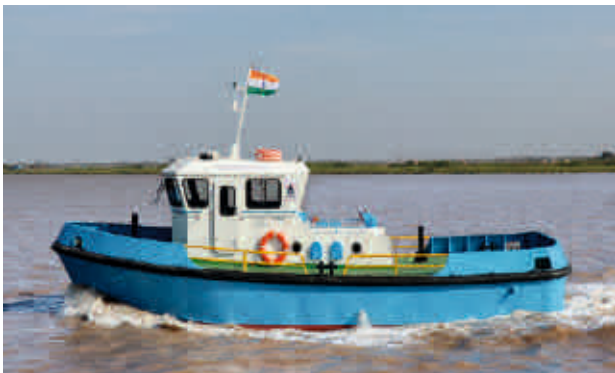
13 M Steel Tug