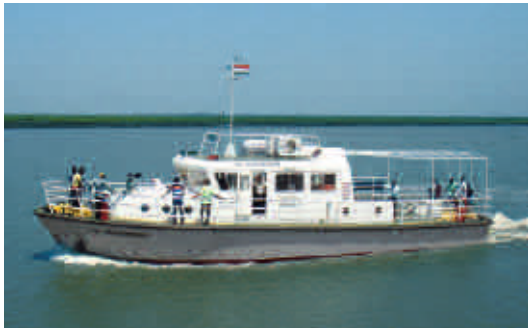
18 M Survey Launch