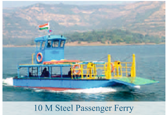
10 M Steel Passenger Ferry