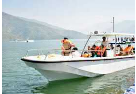
8 M Patrolling Boat