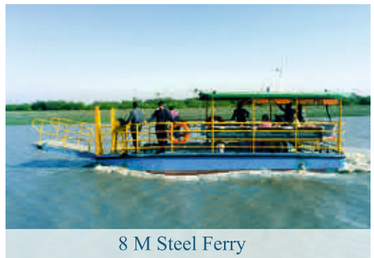
8 M Steel Ferry