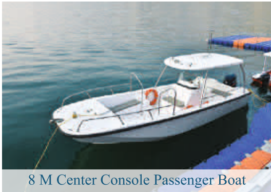
8 M Center Console Passenger Boat