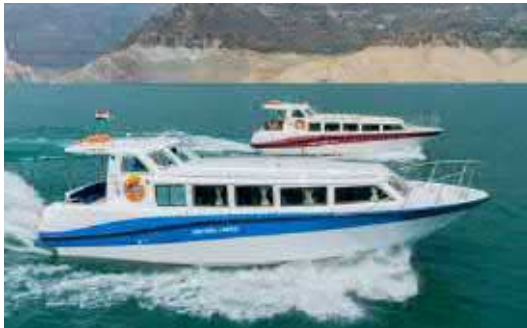
14 M Passenger Boat