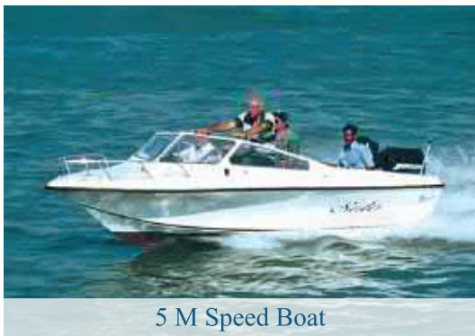
5 M Speed Boat