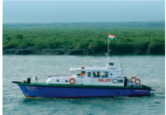
15 M Steel Pilot Boat