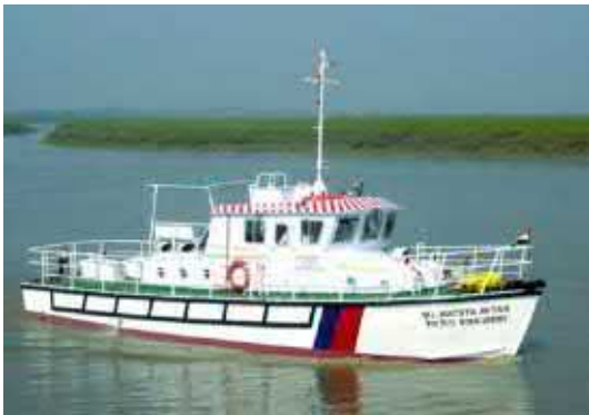
15 M Steel Patrol Boat