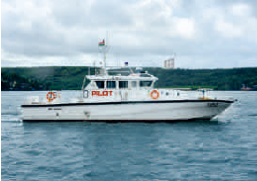
18 M FRP Security/Pilot Boat

We deliver unique and customized solutions to suit the required operational profile. The proven design are in compliance with the ISPS norms for security boats.