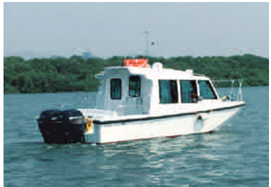
8 M Patrolling boat