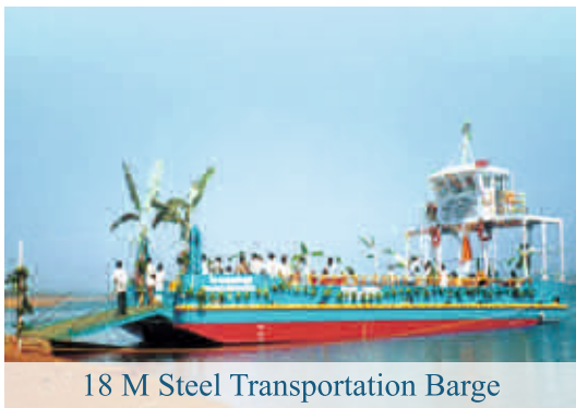
18 M Steel Transportation Barge