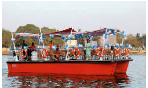
FRP Catamaran Floating Café