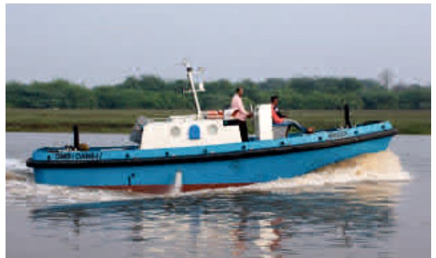
9.7 M Steel Mooring Boat