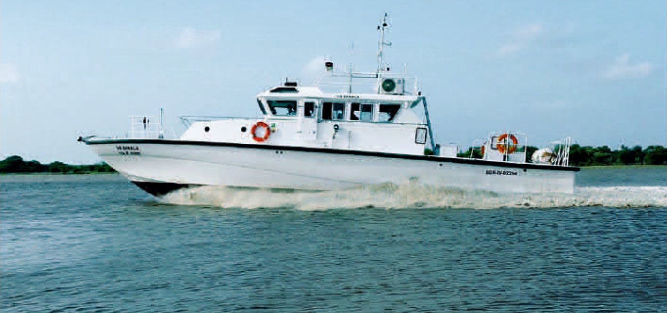
18 M FRP SECURITY BOAT