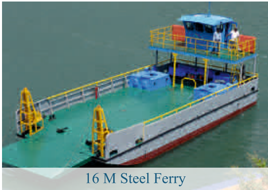
16 M Steel Ferry