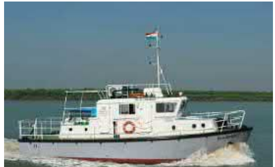
14 M Survey Launch