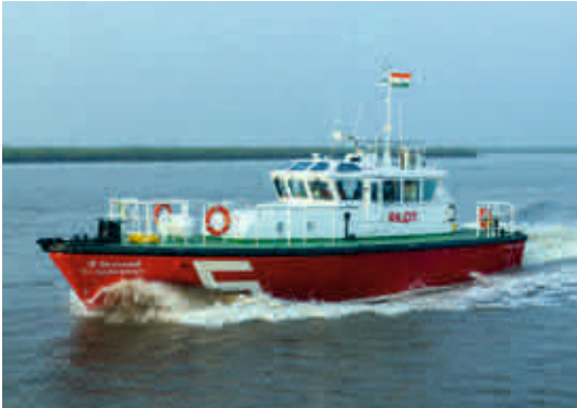
17 M Steel Pilot Boat

Built with proven design and robust construction, the pilot boats are serving at ports nationwide. Constructed with quality materials and modern workboat standards, the low drag hullform gives better operational fuel economy.