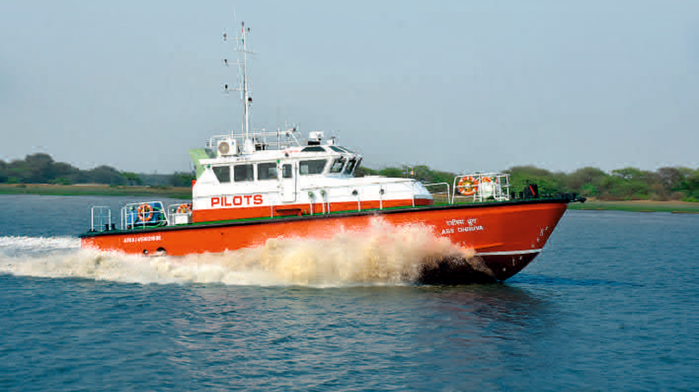
19 M STEEL PILOT BOAT