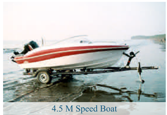
4.5 M Speed Boat