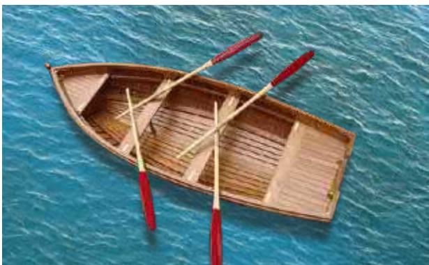
Teak Wood Row Boat