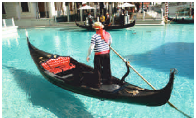
Electric Gondola Boat