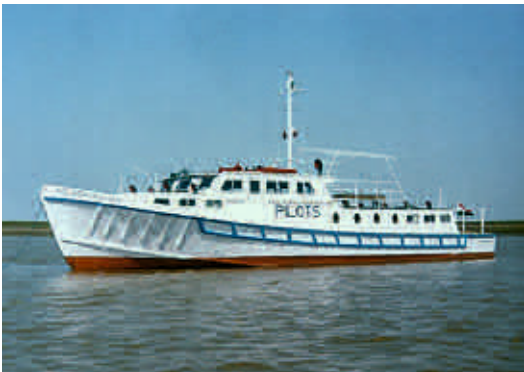
18 M Pilot Boat