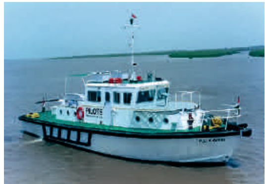
17 M Steel Pilot Boat