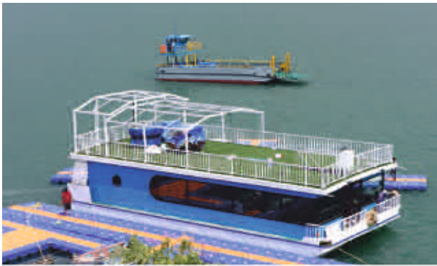
Twin Deck Floating Restaurant