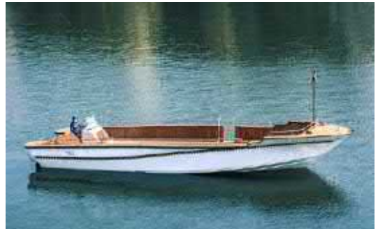
15 M Open Passenger Boat