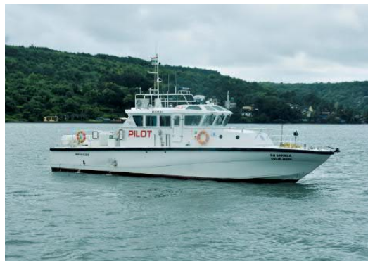
18 M FRP Pilot Boat