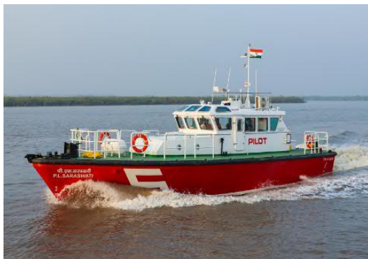
17 M Steel Pilot Boat

A. H. WADIA BOAT BUILDERS is one of India's leading boat manufacturers, specialising in the design of seaworthy working crafts these include Pilot Boats, Security and Patrol, Ferries, Crew Boats, Mooring Boats, Tugs etc. Wadia Boats are in operation at several Government and Port Authorities Nationwide. Built with quality components, these work boats give better operational economy.