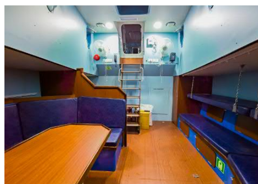
Comfortable AC Accomodation for Crew