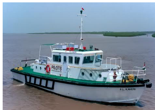
17 M Steel Pilot Boat