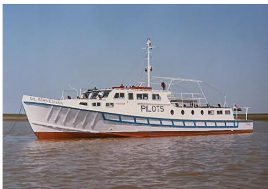
18 M Pilot Boat