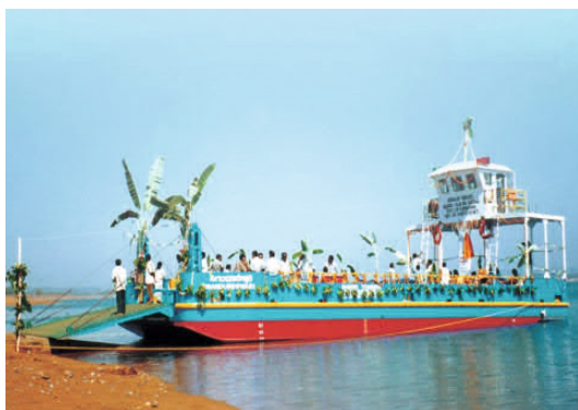
18 M Steel Transportation Barge