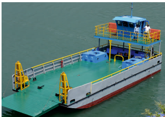
16 M Steel Ferry

Discover Steel landing barges and Roll-on/Roll-off (RORO) ferries, crafted with proven designs, redefine water transportation. Daily passenger commuting and vital flood relief operations are paramount operations our barges are delivered to many organizations across the country. A. H. Wadia Boat Builders stands at the forefront of inland ferry manufacturing, ensuring reliable solutions that keep communities connected and safe across waterways.