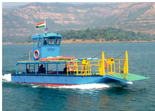
10 M Steel Passenger Ferry