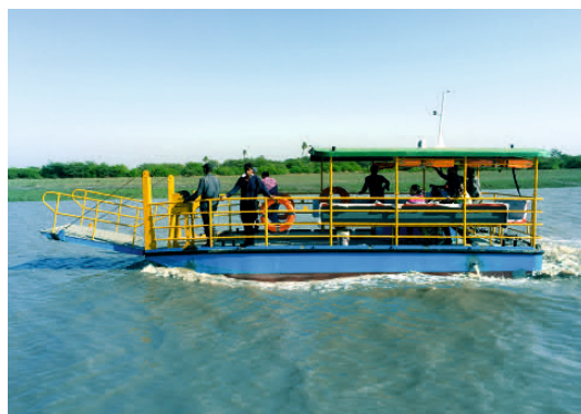
8 M Passenger Ferry