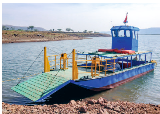
Ideal in Shallow Waters