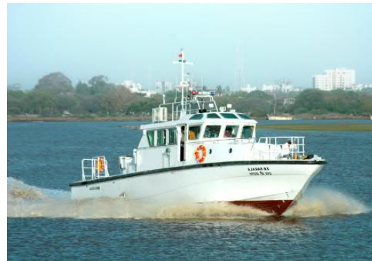
18 M FRP Security/Pilot Boat