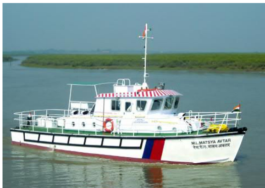
15 M Steel Patrol Boat