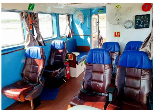
Pilot Seating Space