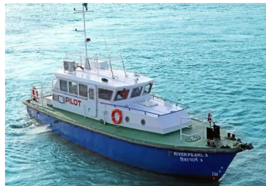
15 M Pilot Boat