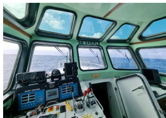
360° Visibility from Wheelhouse