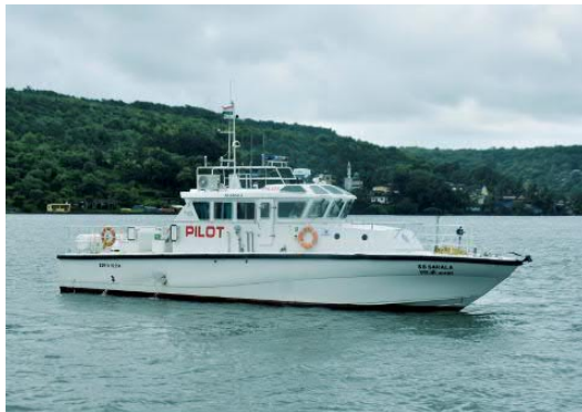
18 M FRP Security/Pilot Boat

A. H. WADIA BOAT BUILDERS is one of India's leading boat manufacturers, specialising in the design of seaworthy working crafts these include Pilot Boats, Security and Patrol, Ferries, Crew Boats, Mooring Boats, Tugs etc. Wadia Boats are in operation at several Government and Port Authorities Nationwide. Built with quality components, these work boats give better operational economy.