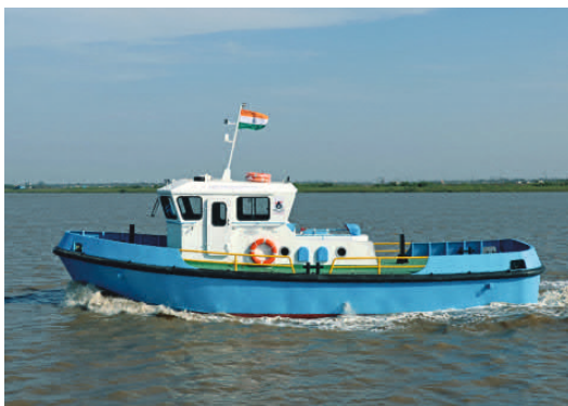
13 M Utility Boat