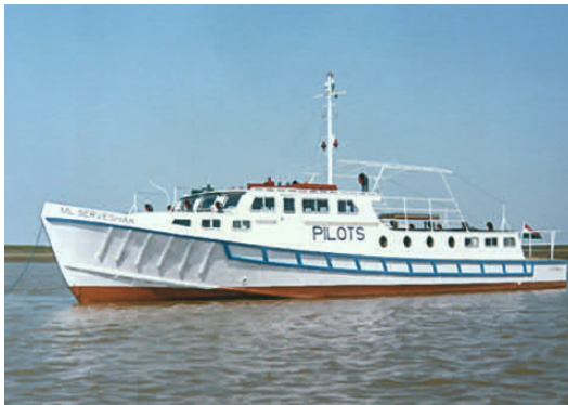
19 M Survey/Pilot launch

A. H. Wadia Boat Builders excels in crafting top-tier hydrographic survey boats. Our boats are meticulously designed and built with superior craftsmanship with the highest quality components. They guarantee optimal operational economy, enabling seamless navigation and data acquisition for various applications, including charting seabeds, evaluating marine resources, and enhancing maritime safety. Trust Wadia's hydrographic survey boats to elevate your surveying capabilities and streamline your marine operations.