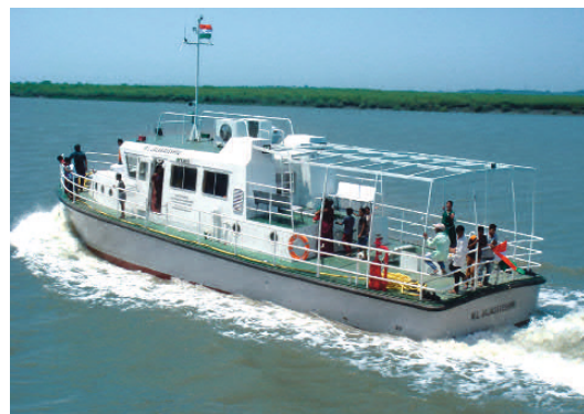
16 M Survey/Pilot launch