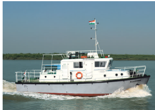
14 M Survey Launch