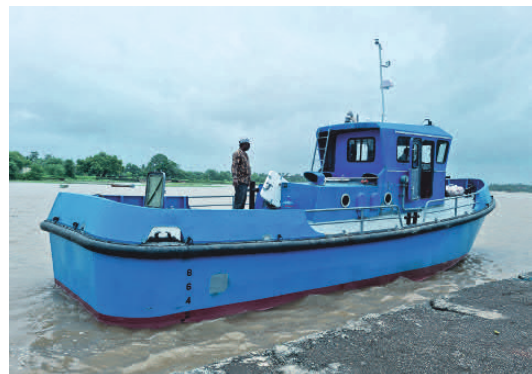
13 M Steel Pusher Tug Boat