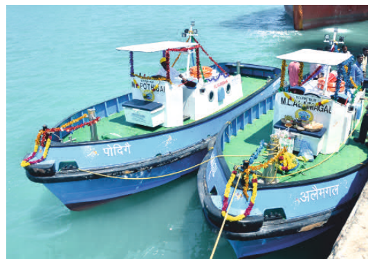
9.7 M Steel Mooring Launch