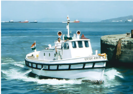
9.7 M FRP Mooring Launch

A. H. Wadia Boat Builders is renowned for crafting proven mooring boats, embodying superior seaworthiness and efficiency. Our mooring boats, constructed with high-quality components ensure reliable and efficient mooring operations. In Operation at various Major and minor Ports nationwide, these boats stand as a testament to our commitment to maritime innovation and performance.