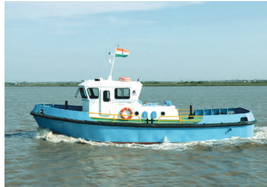
13 M Steel Utility Boat