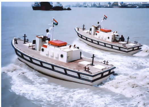
9.7 M FRP Mooring Launch