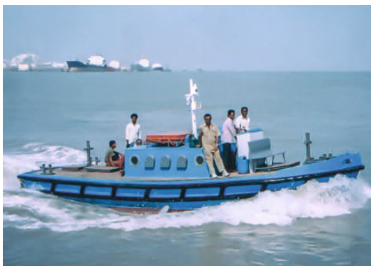
9.7 M FRP Mooring Launch