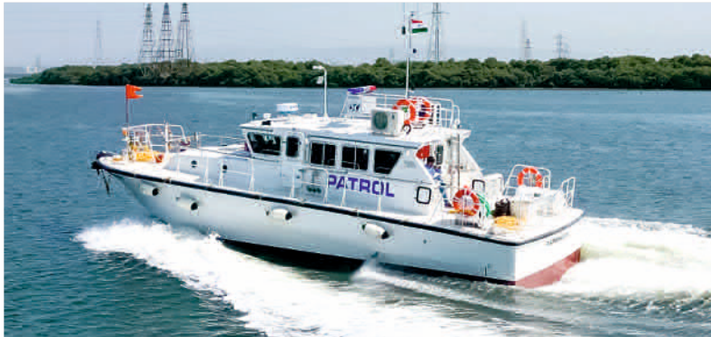
⚓ OFFSHORE CAPABILITIES

Wadia Boats excels in crafting reliable patrol boats, ensuring superior seaworthiness and efficiency. Our 15M Twin Screw FRP Pilot/Patrol Craft is designed for 24x7 operations, equipped with quality components and a layout for easy maintenance. Ideal for day-to-day port activities and harbor security, it features air conditioning, sofa seating, pantry, WC, bunk beds, and CCTV, elevating maritime security operations with comfort and efficiency.