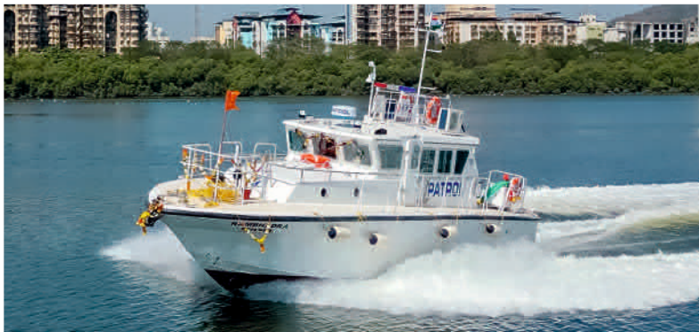
⚓ AGILE MANEUVERING