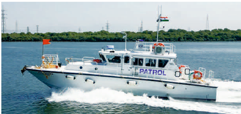
⚓ SUPERIOR PERFORMANCE