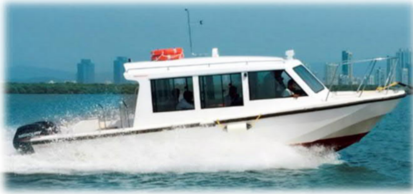
8 Meters, FRP High-Speed Patrol Boat - https://youtu.be/yR_5O-o5xGY?si=WZaT_XB1bzTMhx39