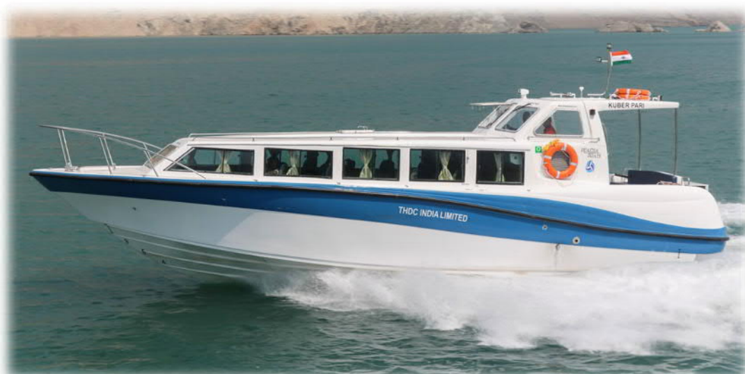
14 Meter, FRP High-Speed Passenger Boat - https://youtu.be/M6 MDpE9jil