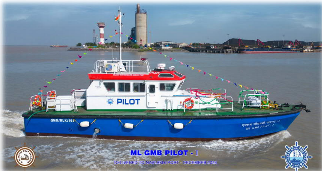
18 Meter, Steel Pilot / Patrol Boat - https://youtu.be/_2tPZRCSZRE