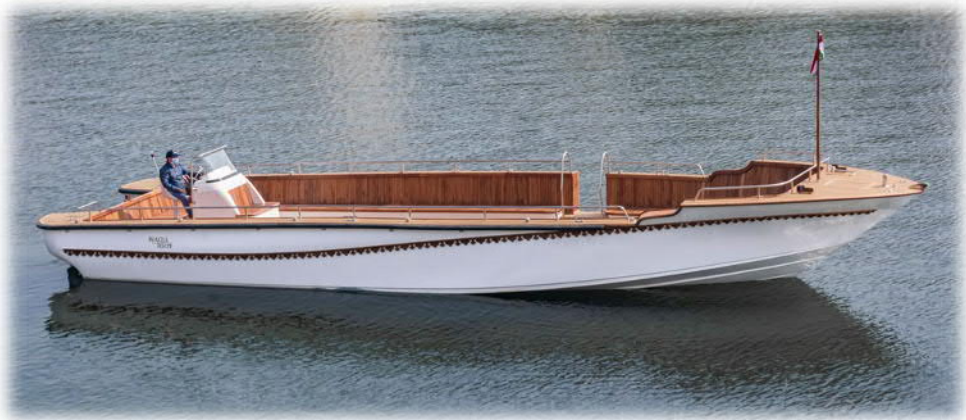
15 Meter, FRP 40-Pax Cruise Boat

We can support a range of Boat Design and Design Construction possibilities with client specification, Please feel free to contact us for any inquiries.