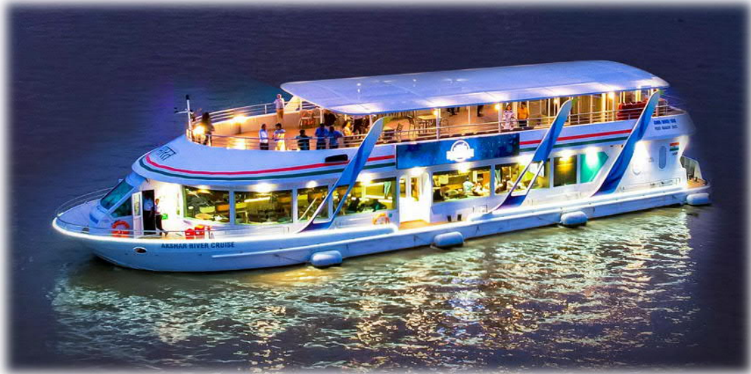
30 Meters, 150Pax, Twin Deck, River Cruise Boat - https://youtu.be/bE0v1pZ0-34?si=cYKFtYFBJfXjpxX