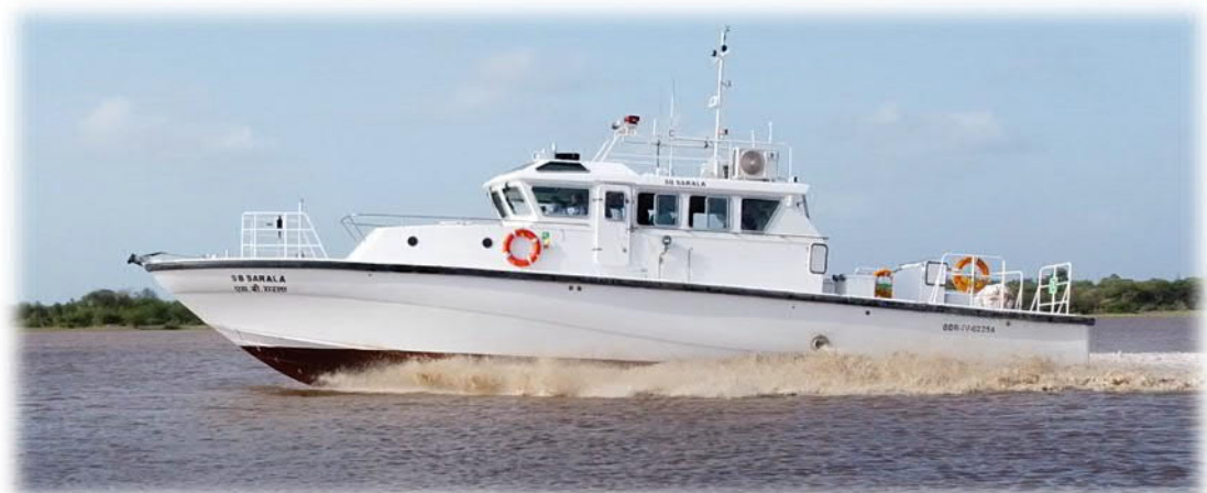
18 Meter, FRP Security / Pilot Boat - https://youtu.be/EGOKvls1CYo?si=1X9S-aXJDX7tpQag