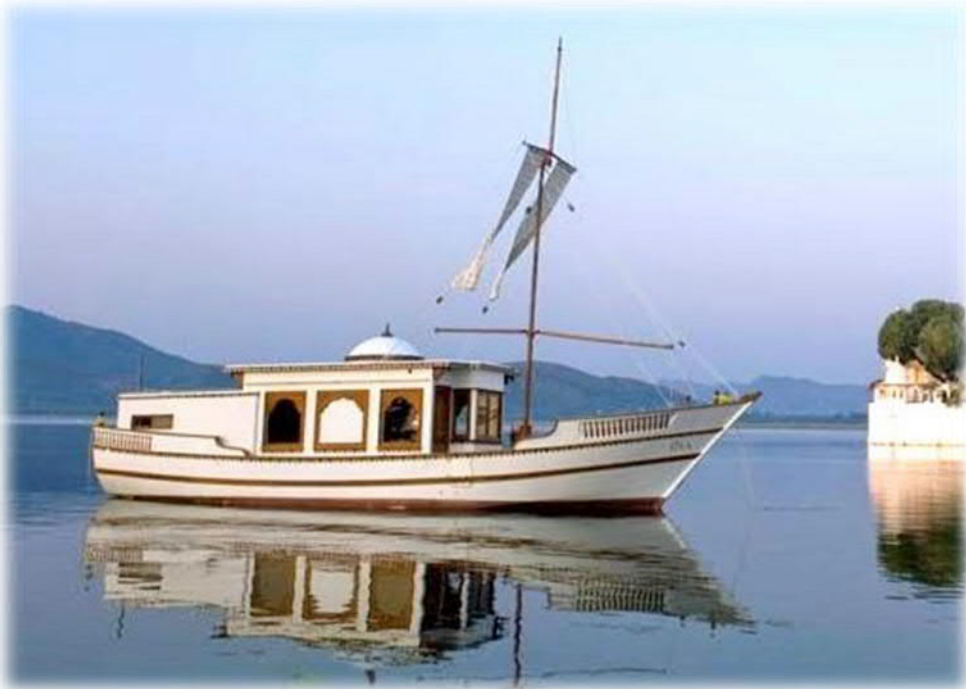
15 Meters, FRP Bespoke SPA Yacht – Taj Lake Palace, Udaipur