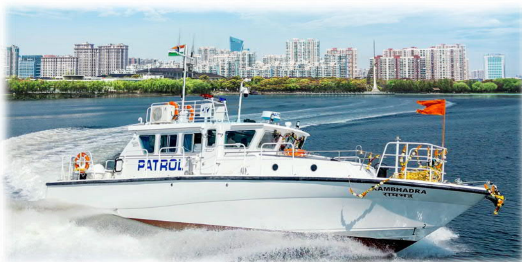
15 Meter, FRP High-Speed Patrol Boat - https://youtu.be/ fiYwlhPU9M