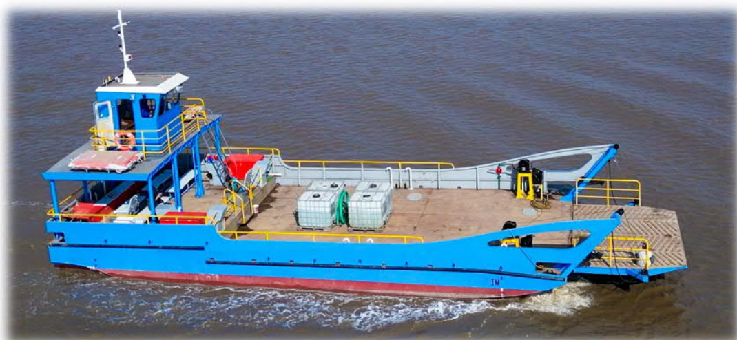
17 Meters, 20 Tonne Steel LCT