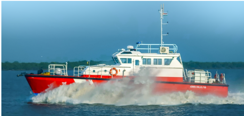
⚓ SUPERIOR PERFORMANCE

Wadia Boats delivers durable and dependable Pilot and Patrol vessels. The advanced 18M Twin Screw Steel Pilot/Patrol Boat is designed for coastal and offshore operations, offering a service-friendly layout, premium components, and exceptional efficiency to ensure reliability in demanding maritime missions.