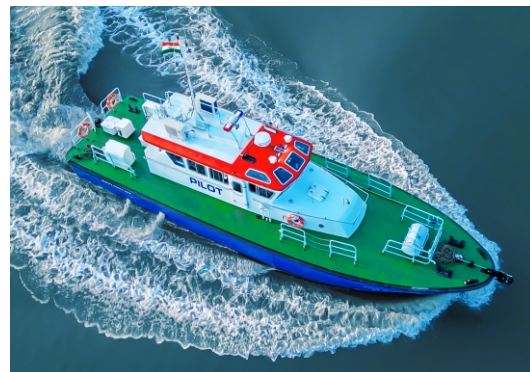
⚓ COST-EFFICIENT OPERATIONS