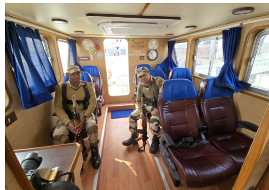
⚓ ENHANCED COMFORT